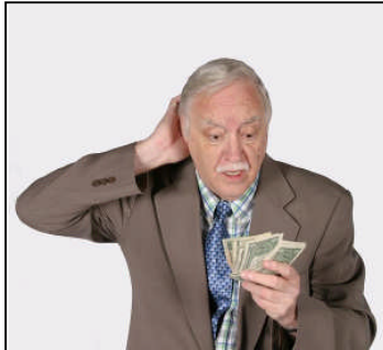
The illusion of Attention, The illusion of Memory, The illusion of Knowledge, The illusion of Cause, The illusion of Confidence.

Even more challenging is the Illusion of Confidence . As Wall Street Journal reviewer David Shaywitz puts it in an article from June 11, 2010, "we profoundly underestimate our capacity to be fooled." We too often associate confidence with competence ; if people act confidently we assume it must be because they are good at what they do, or precise in their knowledge. But the phrase "con man" is short for "confidence man." At the heart of many poor financial decisions is misplaced confidence in an individual.