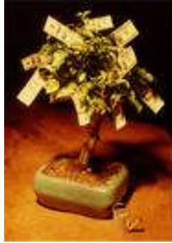
“We profoundly underestimate our capacity to be fooled.”

FINANCIAL RISK MANAGEMENT MAY BE “BORING,” BUT IT WORKS. HOW SOLID IS YOUR RISK MANAGEMENT PLAN?